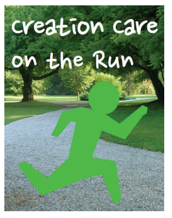
Handouts for Busy Parents